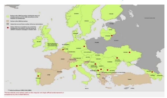
Figure 1 - States Parties to the Statelessness Conventions in Europe